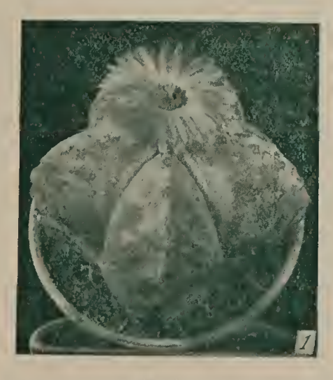
ASTROPHYTUM MYRIOSTIGMA "The Bishop's Cap" Showing typical shape of Astrophytum

To anyone interested I shall loan colored illustrations of Succulents to be returned after one week.